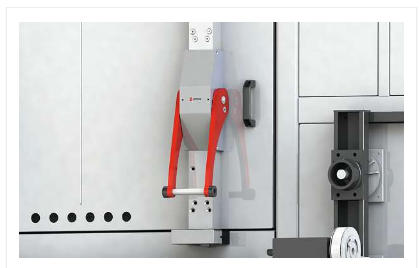
New locking mechanism on the drier doors