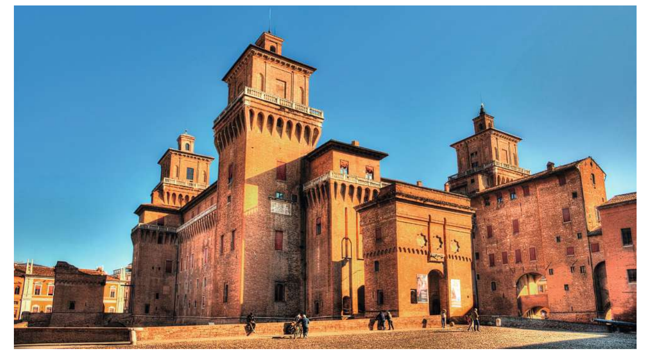
Bonfiglioli is based in the town of Ferrara in Northern Italy, famous for its Castello Estense

in over 75 countries worldwide with an ditional technical synergies, giving Bon-situation.