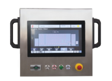
Safe production process due to monitoring and control systems

the fact that over the last few years we have supplied more than ten systems per year, our consistent implementation of detailed improvements has allowed us to further expand our lead in competitive designs once again. The door locking mechanism has been vastly improved, which means that it will be even easier and safer to open