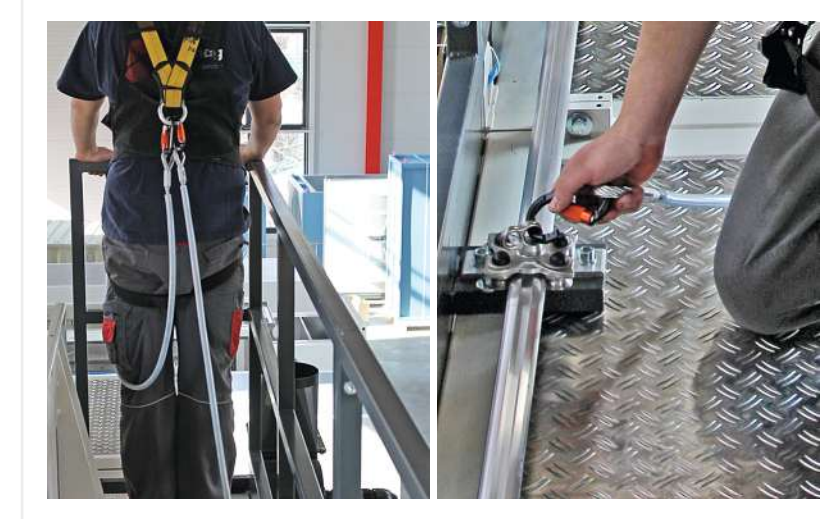
The hand rail on one side with mount fixing points brings increased safety