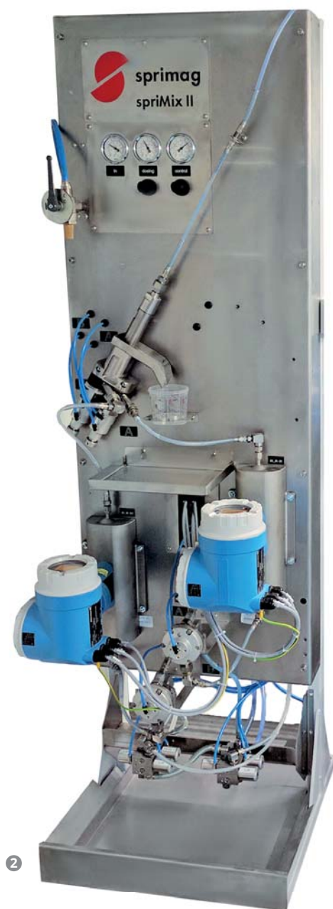
Figure 2: The SpriMixII 2K paint supply.

“The technology was currently set up for significantly higher flow rates, and so needed to be honed into a new solution. Sprimag rose to the challenge and was ultimately able to adjust the mixing technology to also accommodate low flow rates with ease.”