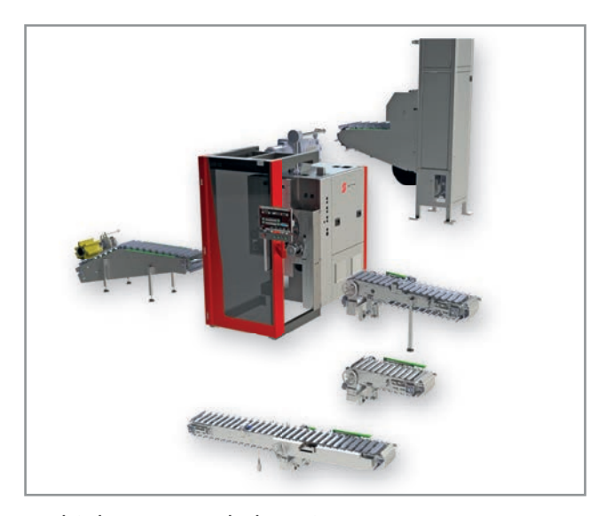
Multiple conveyor belt options