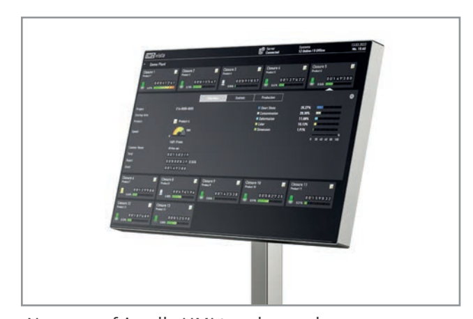
New user-friendly HMI touch panel